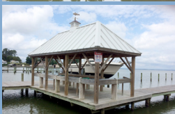
Top: Bethpage Camp-Resort Marina. Bottom: Grey's Point Camp Marina