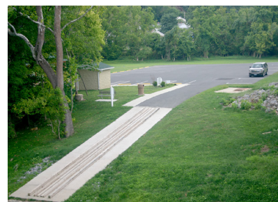
Covington Boating Access Facility

Allen Dressler, with the City of Covington, accepted the award for the Small Access Category for the Covington Boating Access Facility. The Covington Boating Access Facility was the first public access project completed through the VDGIF's Grants to Localities for Public Boating Access Facilities Program. The Program, first offered in June 2012 to localities, aids local governments in developing public access. The completion of this project provides the public with much needed public access to the Jackson River in Covington for 25 years at no additional cost to the users. The Covington Boating Access Facility consists of a concrete ramp/slide with a timber cradle to slide boats onto the river, a paved parking lot with three ADA compliant parking spaces and future plans for ADA compliant restrooms.