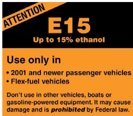
The current E15 warning label.

times as likely to say that the prototype label more clearly conveys the idea of a "warning" for consumers than the current label.